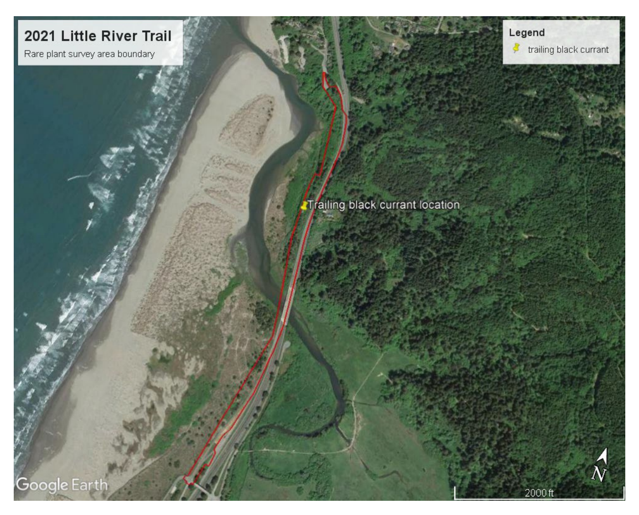
Figure 2: 2021 Little River Trail project study boundary