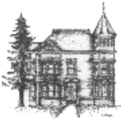
Simpson-Vance House 1892